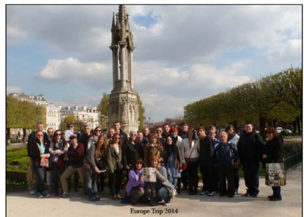
Europe Trip 2014