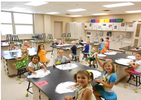
One class of new kindergarteners at Bright Elementary