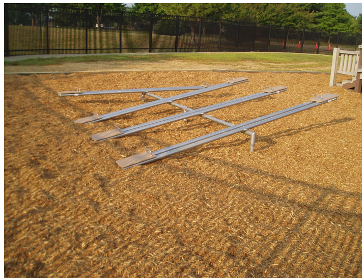
Above: New teeter-totter in the kindergarten play area