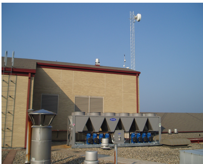
Below: New central air conditioner and microwave tower