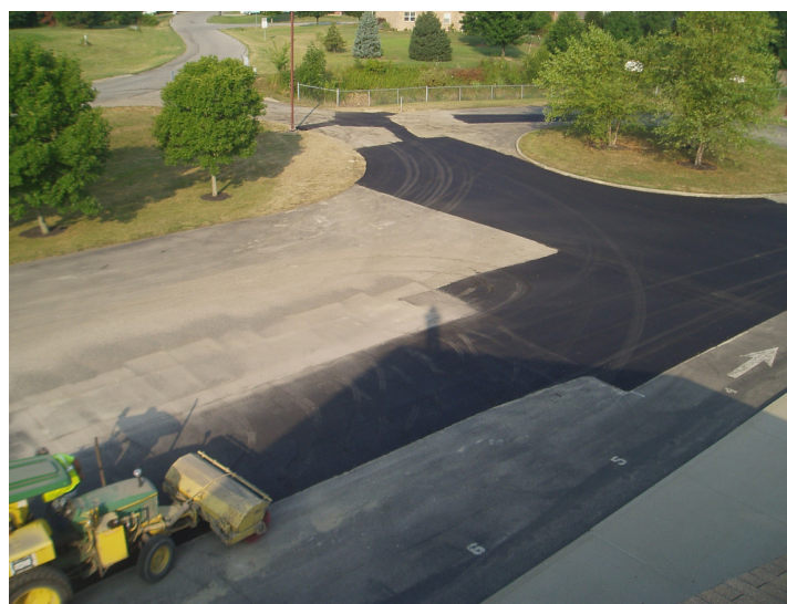
Below: Blacktop resurfacing on our bus lot