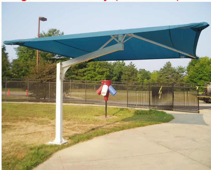
Above: New shade shelter in the kindergarten play area