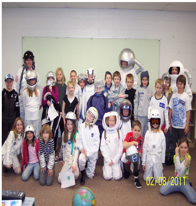
3rd Grade Space Cadets at North Dearborn Elementary