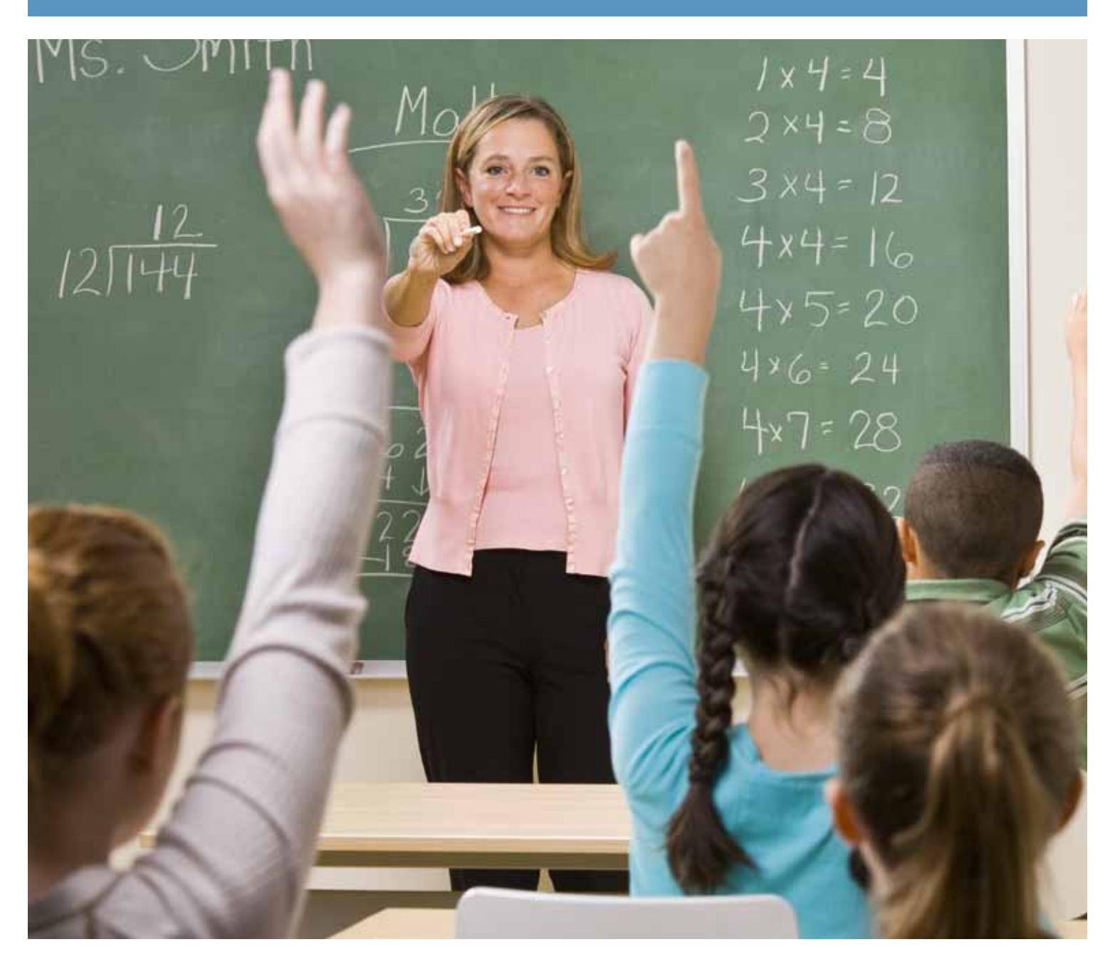
A benefit made exclusively available to your school corporation through a partnership between RE Sutton & Associates, National Insurance Services and Reliance Standard

A new Critical Illness Insurance benefit provided by your employer at no cost to you